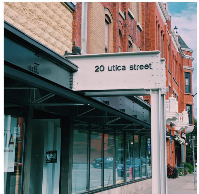
Front entrance and exterior of the building