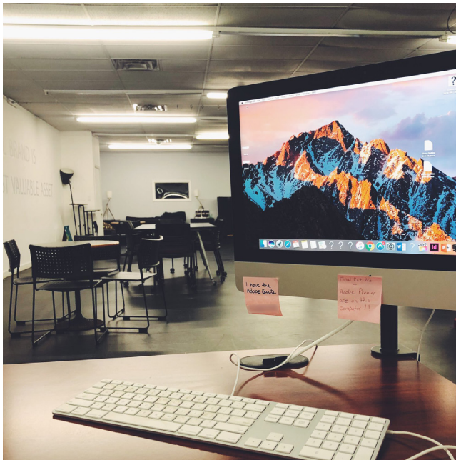
The downtown incubator features an open floor plan and moveable furniture.

In winter 2019, the Partnership for Community Development secured a second grant to replace 18-20 Utica Street with a new building. This new construction will offer coworking and retail space on the ground level and apartments for local professionals on the floors above.