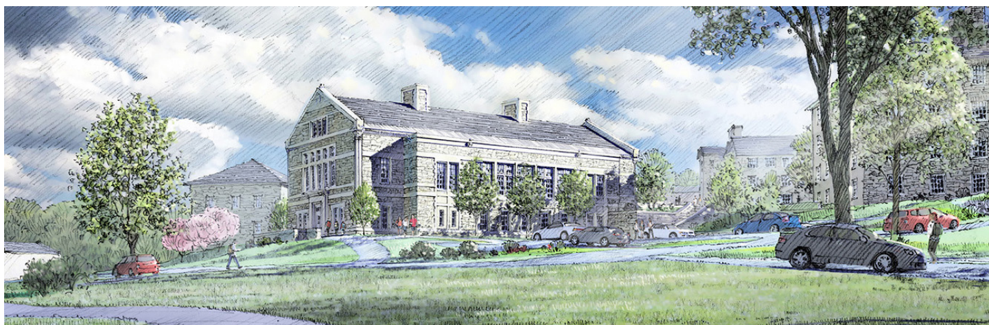
Benton Hall, current administrative home of Thought Into Action

Looking to next year, TIA will focus on delivering an engaging year-long virtual incubator experience due to COVID-19 restrictions limiting on-campus gatherings. A fully remote incubator presents the opportunity to engage a wider range of alumni and parent mentors, supporting the program's goals around diversity, equity, and inclusion. TIA will also be undertaking strategic planning around entrepreneurship initiatives. The newly established TIA Advisory Board will begin its important work to connect TIA to the Middle Campus Plan, a core component of Colgate's Third-Century Plan . The goal is to expand the program's reach to even more students, alumni, and entrepreneurs by solidifying a vision that maintains the essence of the incubator experience while also offering a wider scope of complementary curricular and cocurricular programs related to entrepreneurship and innovation.