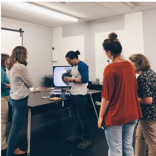
Local entrepreneurs and other community members gather during an open house.