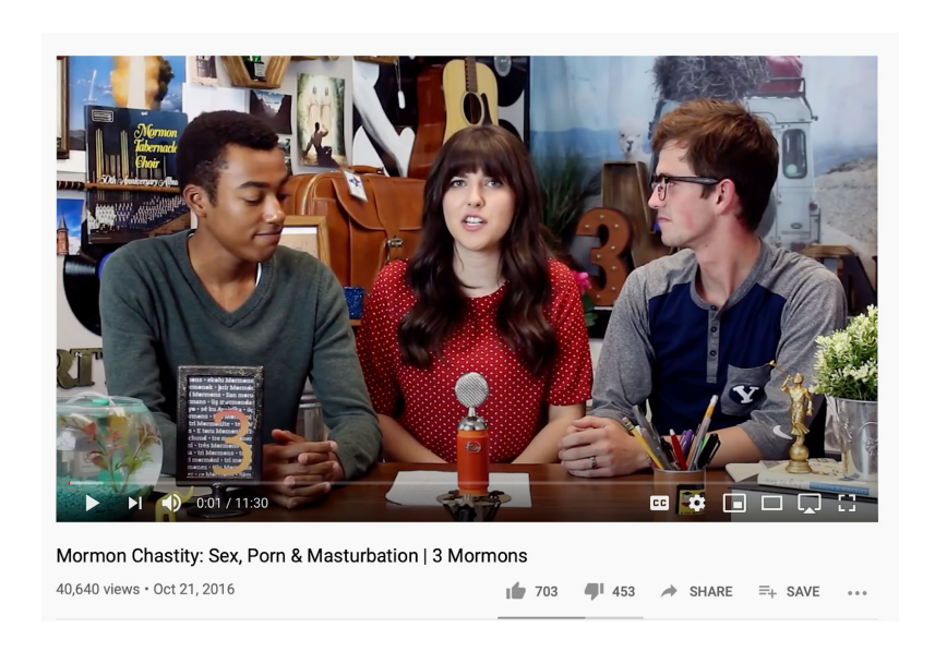
Figure C., Saints Unscripted YouTube Channel.