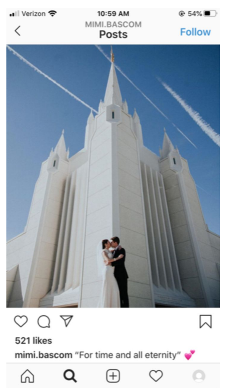
Figure D., Temple Marriage<sup>50</sup>