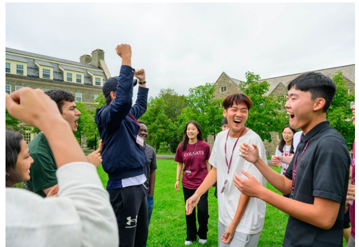
Class of 2027 International Student Arrival Day

During ISO, you will learn all about your F-1 visa status and what you need to do to maintain legal status. Refer to the guides provided with your Form I-20 for instructions on how to apply for your visa and what to expect at a port of entry. (Canadian citizens should refer to the guide on acquiring F-1 status at a U.S. port of entry.) The guides can also be downloaded from the OISS website at colgate.edu/oiss . Refer to the OISS website for detailed information about F-1 visa status, employment authorization, and maintaining valid F-1 status. Another great resource is studyinthestates.dhs.gov/students .