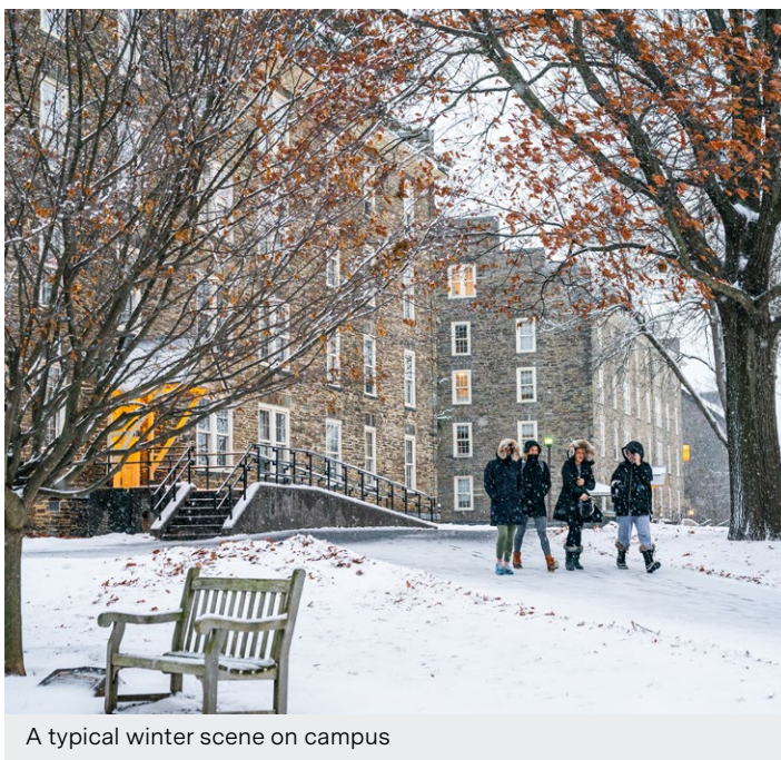
A typical winter scene on campus