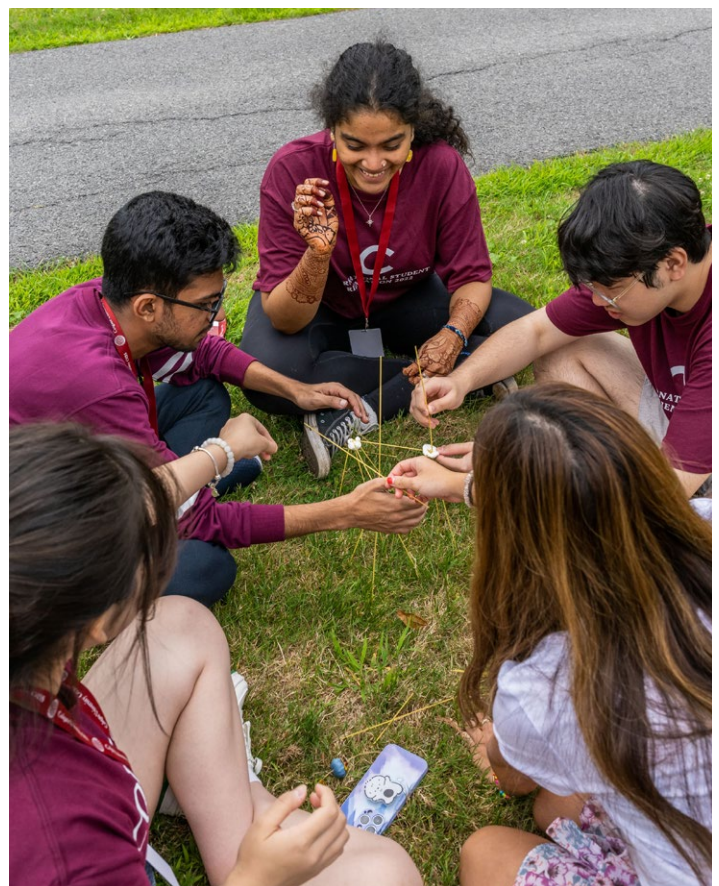
Class of 2026 International Student Orientation activity