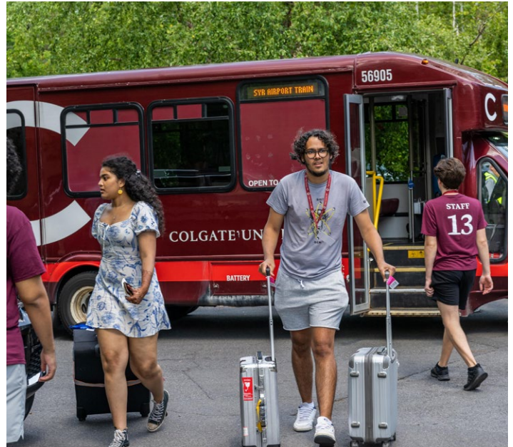
Class of 2026 International Student Arrival Day

Students who enroll at Colgate University are expected to respect the customs, cultures, backgrounds, and rights of all members within the Colgate community. As an F-1 international student, you are required to obey all local, state, and federal laws during your stay in the United States. Any violation of the laws could impact your immigration status. For more information, visit studyinthestates.dhs.gov/students .