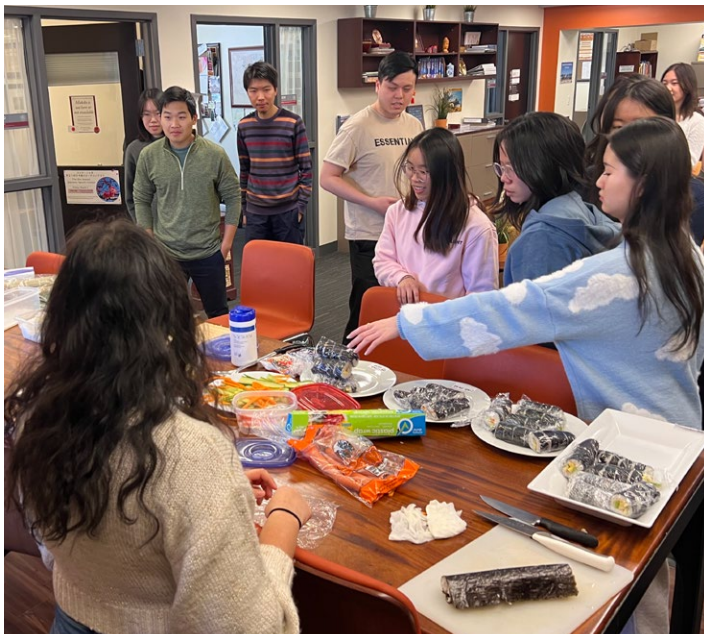
Students share cultural meals in the Center for International Programs.

Seek their advice on majors/minors, any academic difficulties you may be experiencing in your classes, and even your post-Colgate plans. Your academic adviser(s) can be an excellent resource for you throughout your time at Colgate.