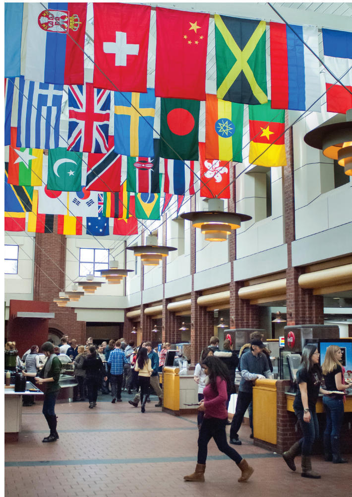
Flags at Frank Dining Hall represent the various backgrounds of students at Colgate University.