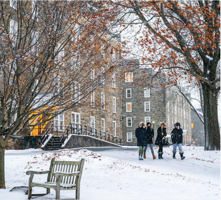
A typical winter scene on campus

*Temperatures can get much colder than the average range listed in this chart. It may reach as low as -30°C! Be sure to come prepared.