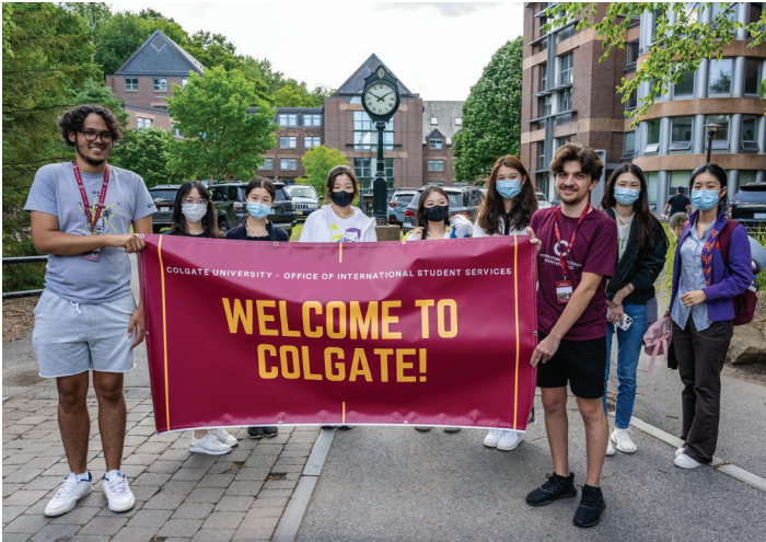
Class of 2026 International Student Arrival Day

During ISO, you will learn all about your F-1 visa status and what you need to do to maintain legal status. Refer to the guides provided with your Form I-20 for instructions on how to apply for your visa and what to expect at a port of entry. (Canadian citizens should refer to the guide on acquiring F-1 status at a U.S. port of entry.) The guides can also be downloaded from the OISS website at colgate.edu/oiss . Refer to the OISS website for detailed information about F-1 visa status, employment authorization, and maintaining valid F-1 status. Another great resource is studyinthestates.dhs.gov/students .