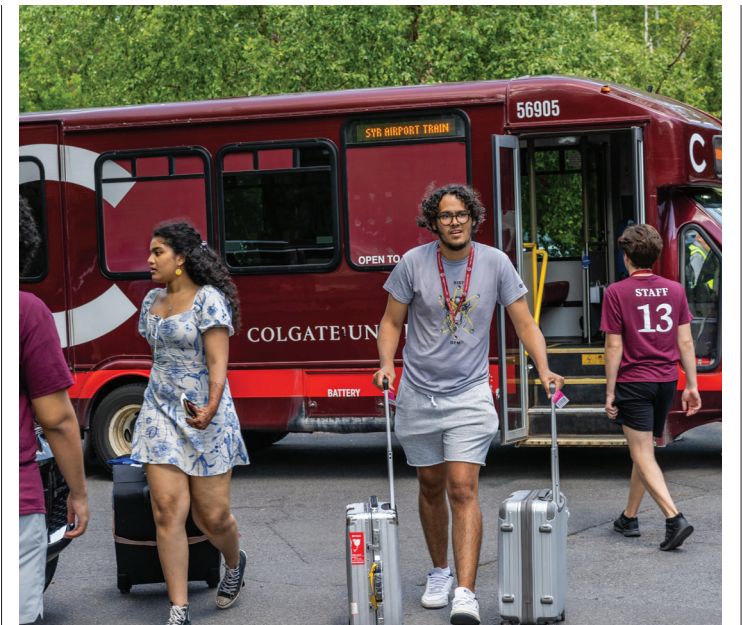
Class of 2026 International Student Arrival Day

Students who enroll at Colgate University are expected to respect the customs, cultures, backgrounds, and rights of all members within the Colgate community. As an F-1 international student, you are required to obey all local, state, and federal laws during your stay in the United States. Any violation of the laws could impact your immigration status. For more information, visit studyinthestates.dhs.gov/students .