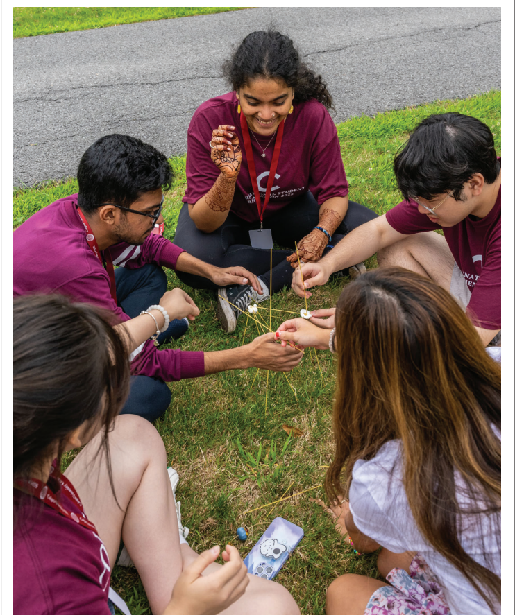
Class of 2026 International Student Orientation activity