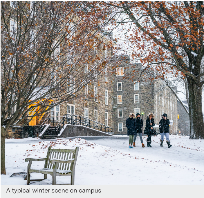
A typical winter scene on campus

*Temperatures can get much colder than the average range listed in this chart. It may reach as low as -30°C! Be sure to come prepared.