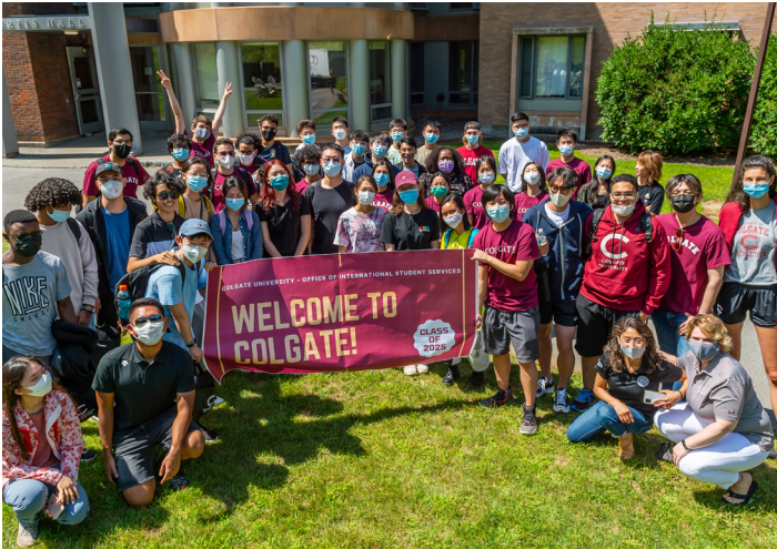
Class of 2025 International Student Arrival Day

During ISO, you will learn all about your F-1 visa status and what you need to do to maintain legal status. Refer to the guides provided with your I-20 for instructions on how to apply for your visa and what to expect at a port of entry. (Canadian citizens should refer to the guide on acquiring F-1 status at a U.S. port of entry). The guides can also be downloaded on the OISS website at colgate.edu/oiss . Refer to the OISS website for detailed information about F-1 visa status, employment authorization, and maintaining valid F-1 status. Another great resource is studyinthestates.dhs.gov/students .