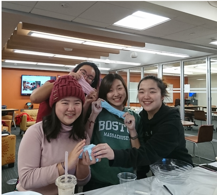
Study Break in the Center for International Programs