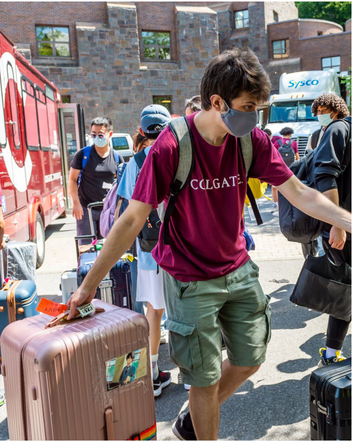
Class of 2025 International Student Arrival Day