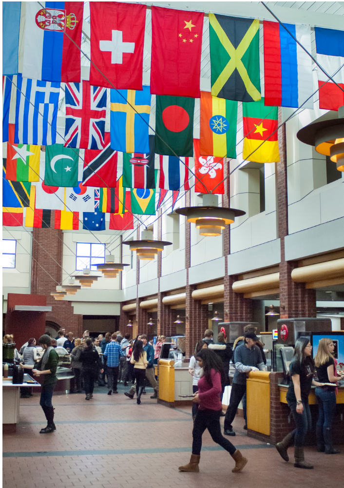
Flags at Frank Dining Hall represent the various backgrounds of students at Colgate University.