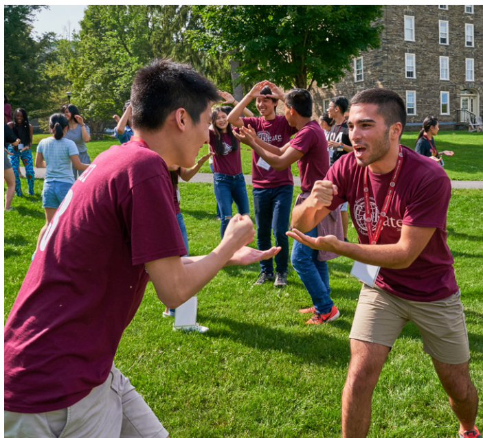
Students at International Student Orientation playing a game