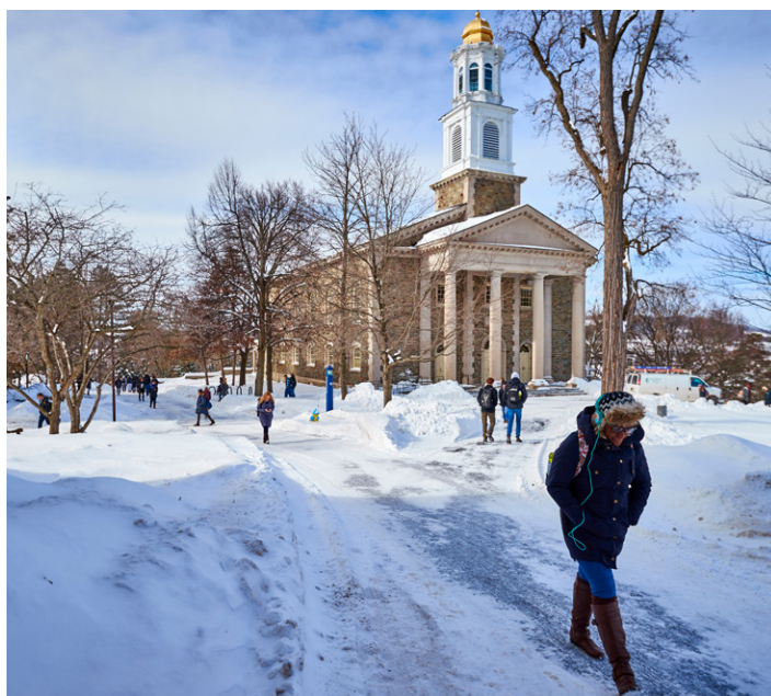
A typical winter scene by Colgate Memorial Chapel