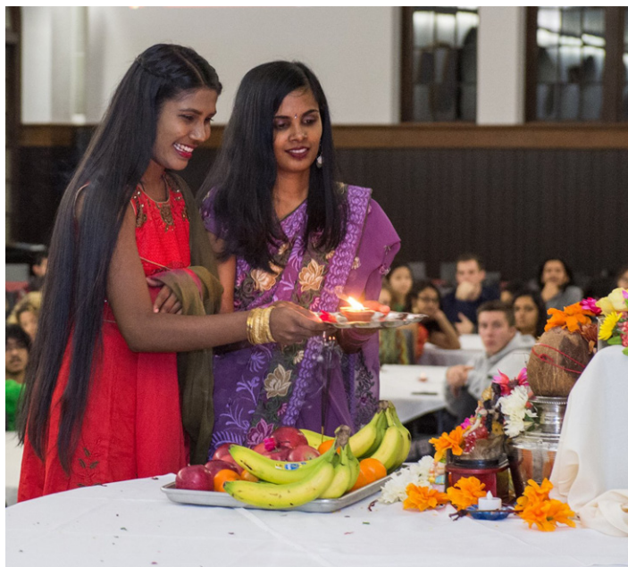
Members of the Colgate community celebrate Diwali.

members within the Colgate community. As an F-1 international student, you are required to obey all local, state, and federal laws during your stay in the United States. Any violation of the laws could impact your immigration status. For more information, visit studyinthestates.dhs.gov/about .