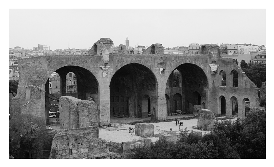
Fig. 7.1 Basilica Nova.

as how the structure fitted into its busy urban surroundings.<sup>34</sup> Nibby's hypothesis was expanded upon in 1932 in a major study of the structure by Minoprio; his interpretation of the Maxentian and Constantinian building phases was widely accepted.<sup>35</sup>