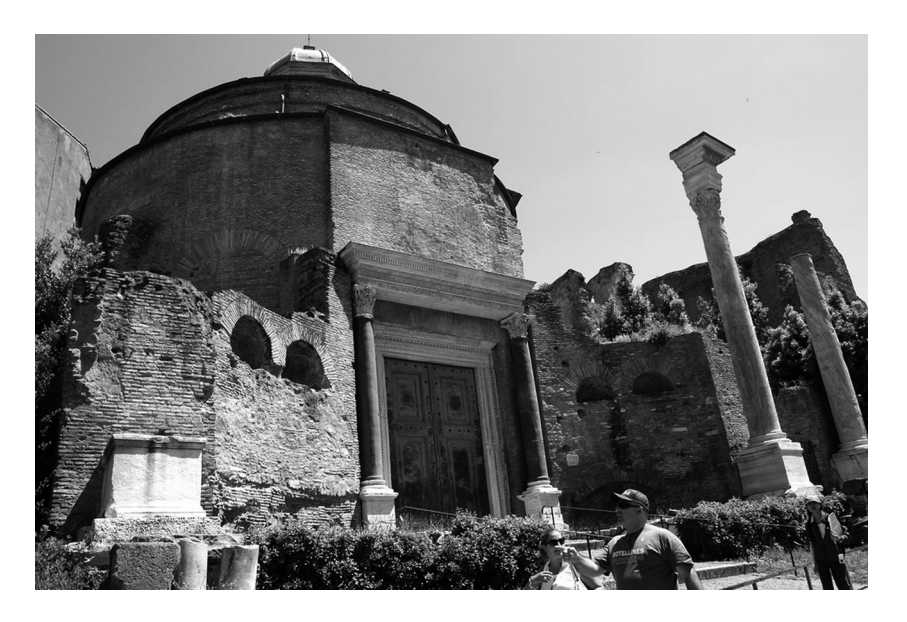
Fig. 7.3 Temple of Romulus.

was radically remodeled, bisected across its width and outfitted with a transverse apse (fig. 4). These alterations transformed the room from a simple rectangular space into one that closely resembled a typical Roman apsidal audience hall.<sup>42</sup>