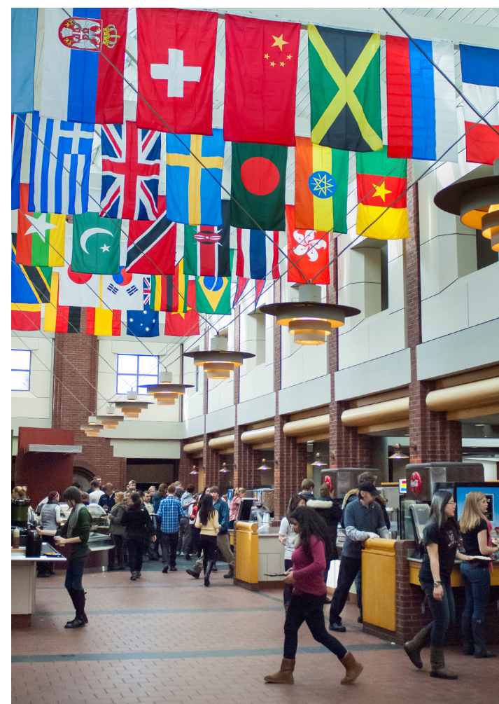
Flags at Frank Dining Hall represent the various backgrounds of students at Colgate University.

Students who enroll at Colgate University are expected to respect the customs, cultures, backgrounds, and the rights of all members within the Colgate community. As an F-1 international student, you are required to obey all local, state, and federal laws during your stay in the United States. Any violation of the laws could impact your immigration status. For more information, visit https://studyinthestates.dhs.gov/about .