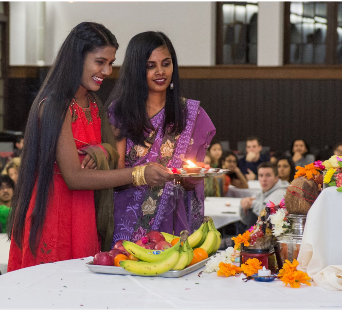
Members of the Colgate community celebrate Diwali.