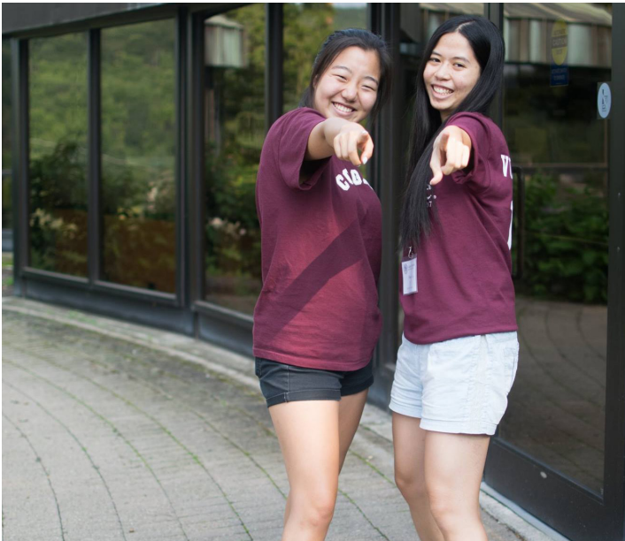
Student leaders at International Student Orientation

Wednesday, August 21–Saturday, August 24, 2019