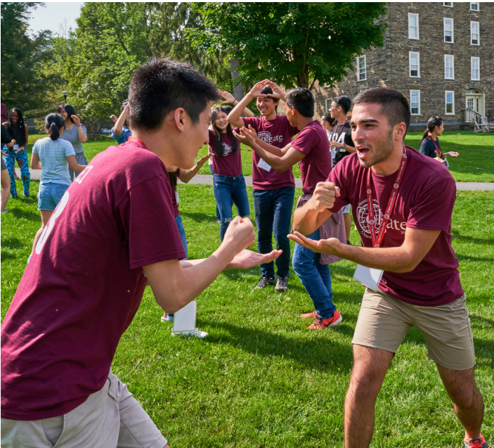
Students at International Student Orientation playing a game