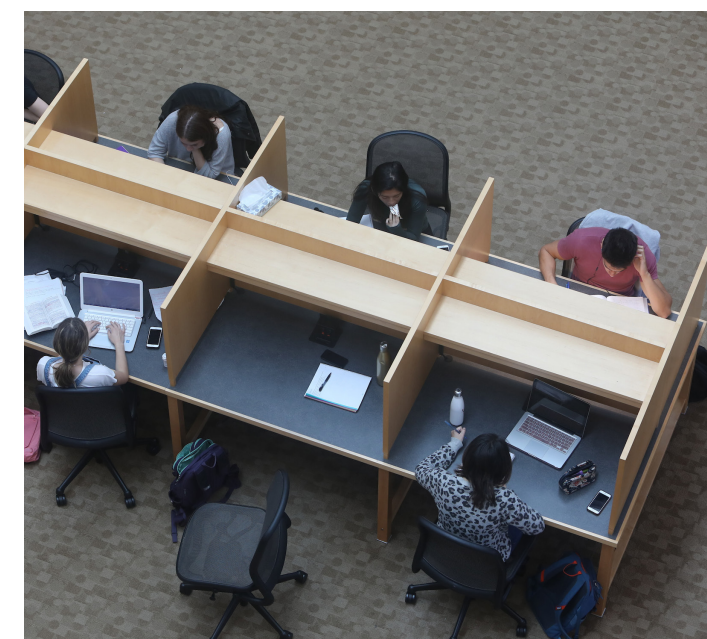
Students studying at Case-Geyer Library

Violations of the Code of Student Conduct and the Academic Honor Code will be addressed through the University disciplinary process. We encourage you to visit the links above to learn more about the disciplinary process. Additionally, violations of the Code of Student Conduct that are related to discrimination and harassment (including sexual harassment) may be addressed through the Equity Grievance Policy (EGP), which is described in detail in the Student Handbook. Although the University strives to be a safe and inclusive space for