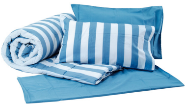
Linen set

Clothing purchase options in Hamilton are very limited, so you should plan to bring clothing with you. Since the weather can change very quickly, we recommend that you bring a jacket, sweater, and heavy coat. Students typically dress casually (t-shirt, jeans, khaki pants, button down shirt, sweatshirt, etc.) while attending classes, but there will be occasions where you will need to dress more formally and/or wear business attire (dress pants, dress shirt, blazer, dress, suit, tie, etc.). Also, there are several events on campus for which many students choose to wear the traditional clothing of their countries, so if this interests you, it’s a good idea to bring some traditional garments from home.