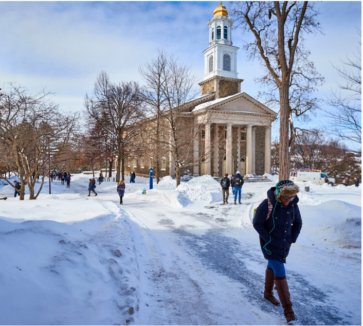
Typical winter scene by Memorial Chapel

NAME ’23 (Your name followed by class year) COLGATE UNIVERSITY CU BOX (Your Colgate University Box number) 13 OAK DRIVE HAMILTON, NY 13346 USA