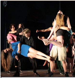
From: http:// hop.dartmouth.edu/ performances/dartmouthdance-theater-ensemble

The dance itself took place that night at 8pm in Parker Commons. It was a