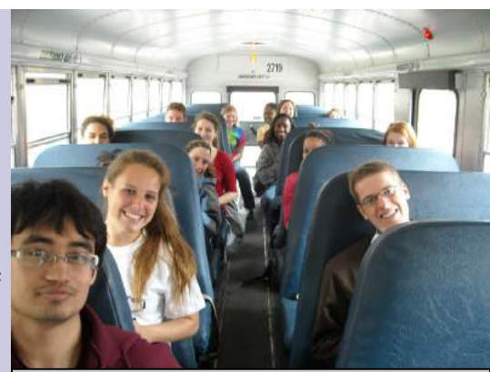
On the bus students and staff gear up to participate in this collaborative day of service within the greater community.

The day had a group of 30 students working at 8 sites spread out around Utica. Once my group arrived at our site, the Underground Café, a safe space for youth after school, put us directly to work. They were preparing for their biggest