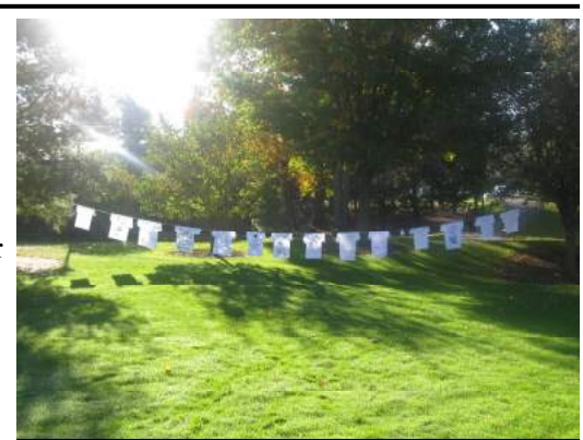
Strewn between trees on the quad are t-shirts decorated with messages against sexual abuse and domestic violence.

The Clothesline Project is a national awareness-raising initiative. Anyone was welcome to paint messages on white t-shirts to convey their experiences with sexual violence and the experiences of those they know who have experienced sexual violence and to express solidarity with victims. The shirts were then hung up on a clothesline.