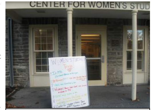
A sign outside the Center gives trivia about Women's Studies and coeducation to passers-by.

The discussion of the program and the Center's history not only conveyed the challenges that women professors on campus faced as they instituted the program but also provided inspiration for the students listening as the women described how they organized to overcome institutional challenges. Lastly, brown bag attendees were left with a renewed sense of pride in and