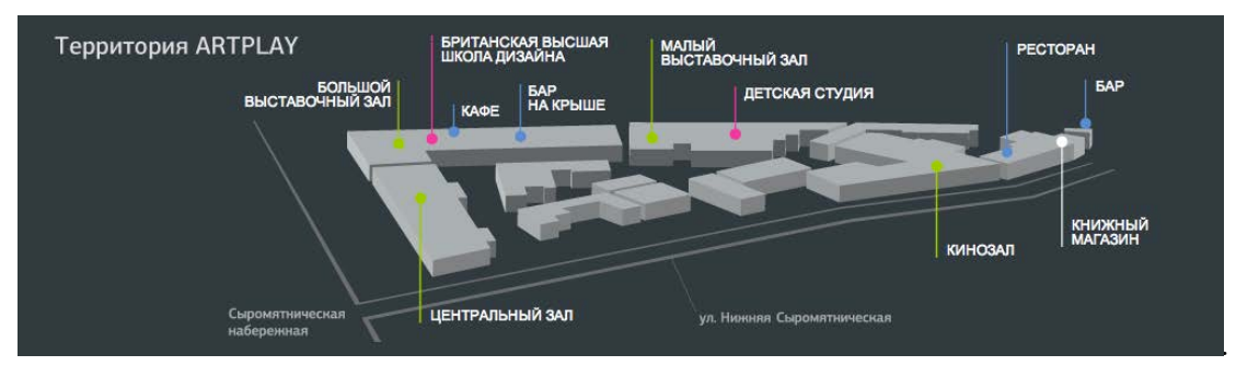
Fig. 6. Map of ArtPlay Moscow Territory.

exhibits, two bars, a café, movie theater, event hall, design school, children's studio and bookstore, all on one campus.<sup>69</sup>