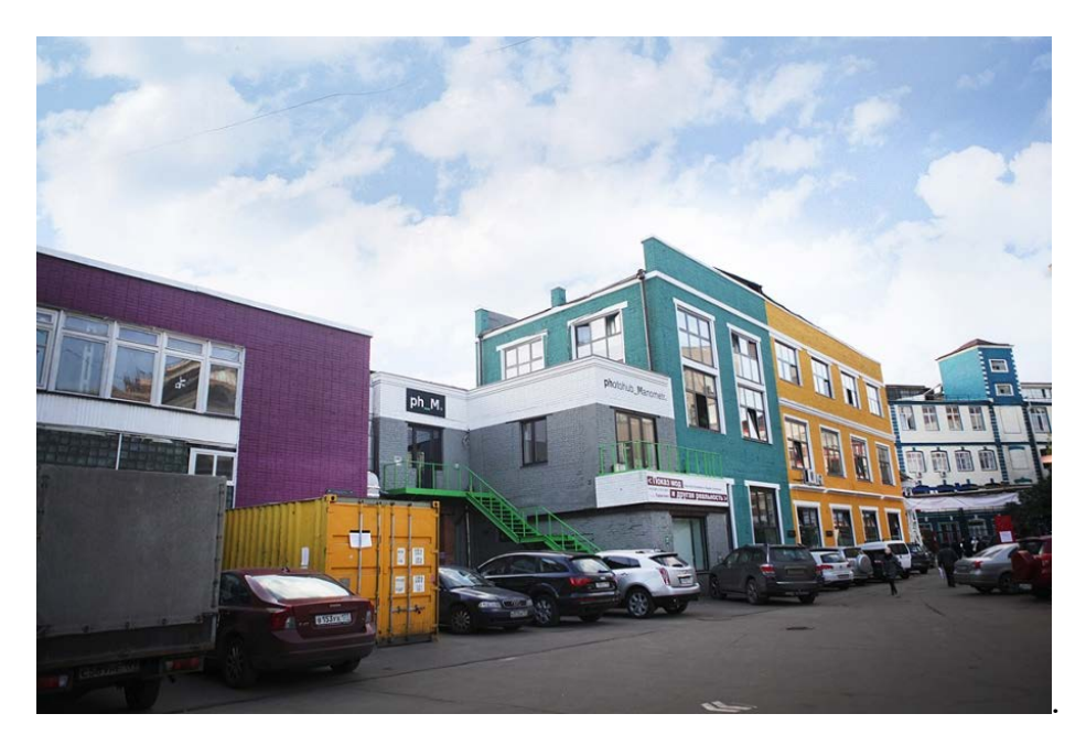
Fig. 7. Scene from within ArtPlay Moscow.

though, as to why they do not locate them in the outskirts of the city, where a similar effect can be achieved as the Collective Actions metaphorical trudge. The hybrid gallery espouses new modes of urban lifestyle, and this is most attainable when a visitor to these galleries sees how capable this ideal, capitalist society is, so frequent and convenient patronage is crucial. The communal social contract is broken, and replaced with the gospel of convenience, inclusion, and most notably, accessibility. In this sense, geographic location is a means to an ends. Hybrid art space designers are not subject to the ideological rigor of a Moscow Conceptualist goblin figure.