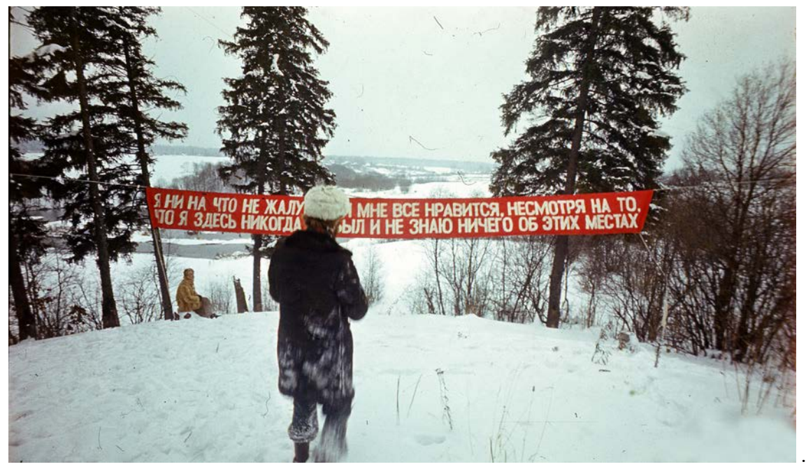
Fig. 5. Collective Actions Group. Slogan. 1977.

invisible as possible.<sup>33</sup> In this sense, Collective Actions devised the ideal installation long before Kabakov codified it.