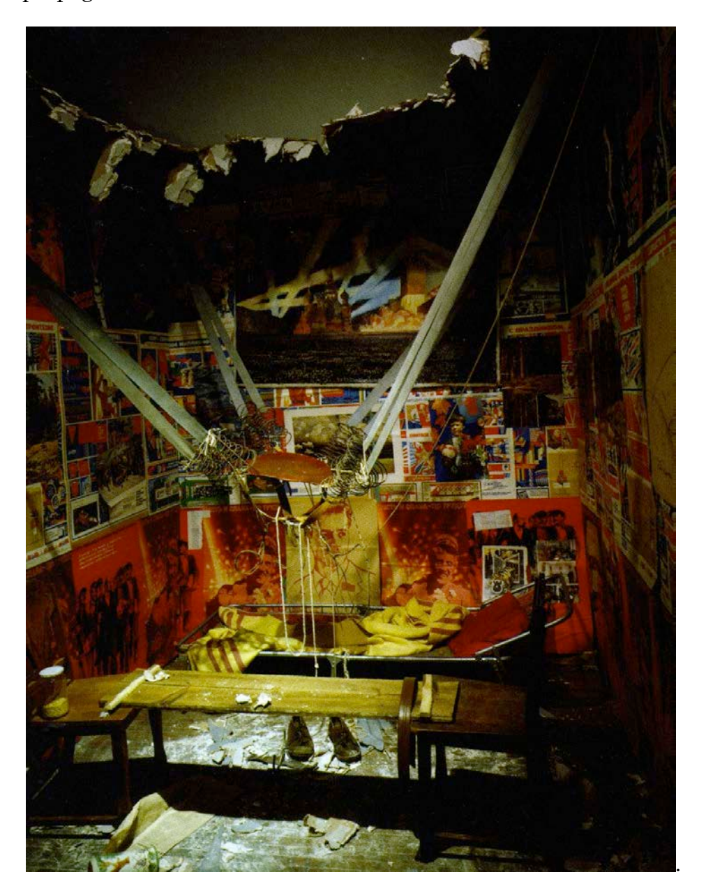
Fig. 4. Ilya Kabakov. The Man Who Flew Into Space From His Apartment. 1985.

absent hero into the cosmos. The walls are plastered with prototype designs for the machine along with tessellated and overlapping posters of old Soviet propaganda and aeronautical heroes.