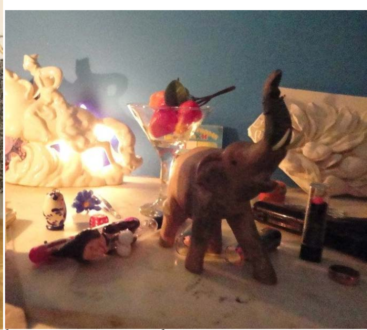
(From Left to Right)

Fig. 8. Betty Rothstein in borrowed dress, March 2012.