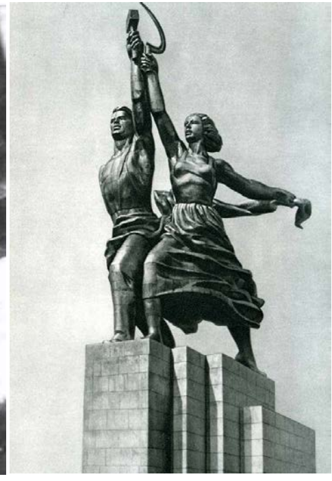
(From Left to Right) Fig. 2. Sergei Bugaev, The Worker and the Female Collective Farmer. 1991, photograph. Victor Tupitsyn. From: The Museological Unconscious . Cambridge: MIT Press, 2009. P. 189. Fig. 3. The Worker and the Female Collective Farmer.

True, the arrangement of Afrika's photographs and objects at the Queens Museum in 1991 is an installation, but the act of entering the statue was an act of total installation in itself, with the public surroundings as the intended components of the action. To use Clair Bishop's definition, in a work of installation art, as opposed to an installation of artworks, "the space and the ensemble of elements within it are regarded in their entirety as a singular entity. Installation art created a situation into which the viewer physically enters, and insists that you regard this as a singular totality." To put even greater context to our working definition of installation art, we can supplement this idea with a note from Ilya Kabakov who explains, "the main center toward which everything