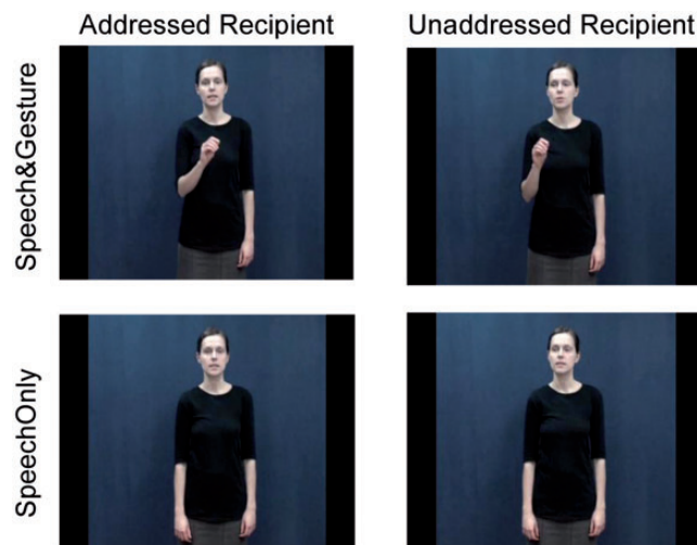
Fig. 2 Example of stills from the four types of video stimuli used.

One of our aims was to avoid confounding the visual angle of the gestures in the addressed and unaddressed conditions with recipient status signaled through eye gaze direction. Thus, rather than showing the same gestures recorded from a lateral and a frontal visual angle, the confederate speaker repeated each stimulus sentence, including the